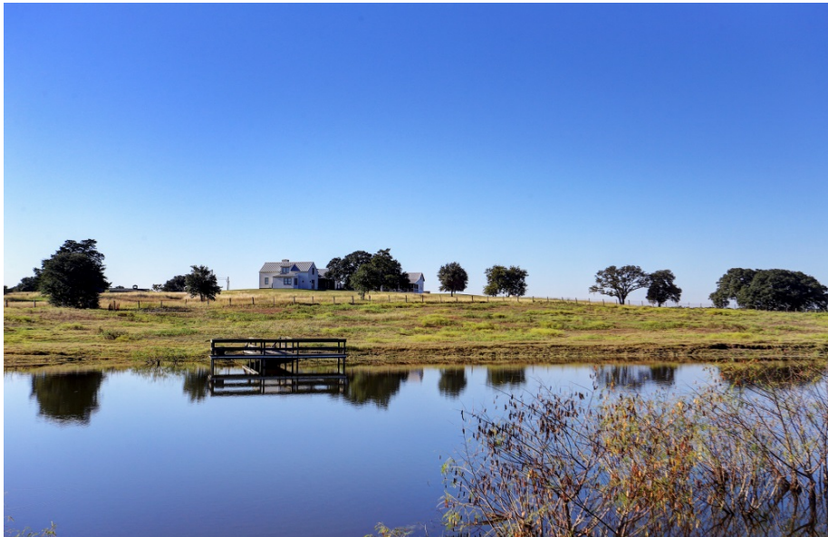
View of House from Pond