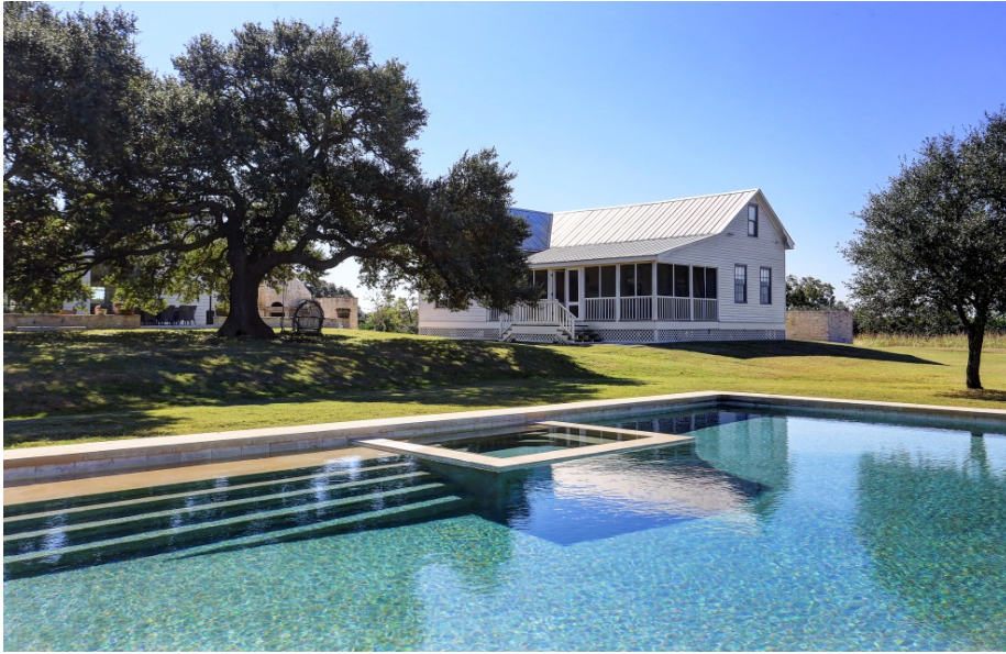
Swimming Pool & Guest House