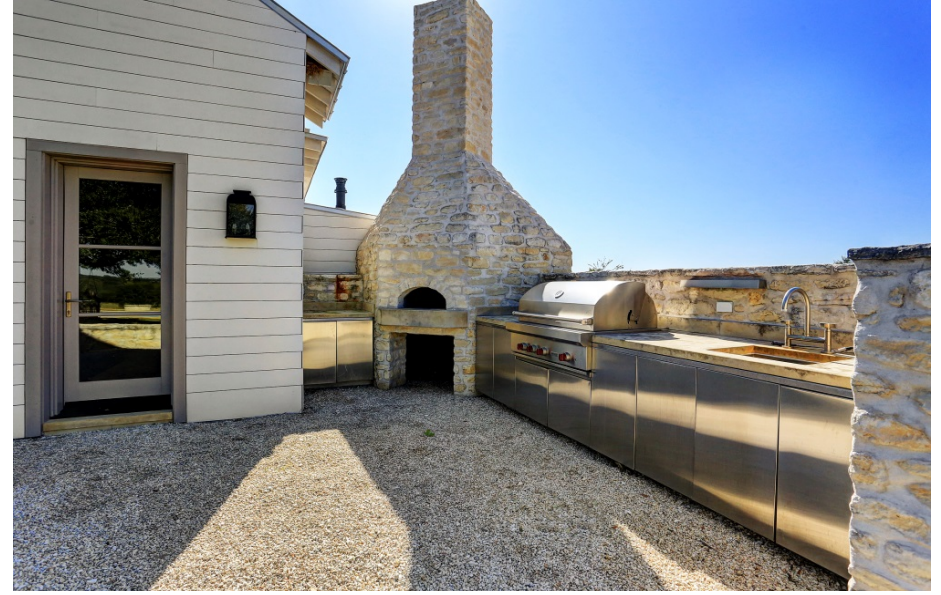
Outdoor Kitchen with Pizza Oven