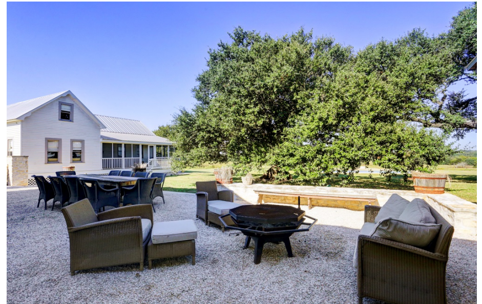
Fire Pit, Guest House & 100 yr. live oaks