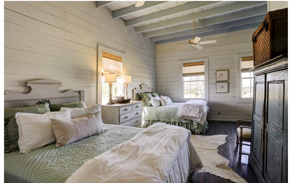
Guest House Bedroom