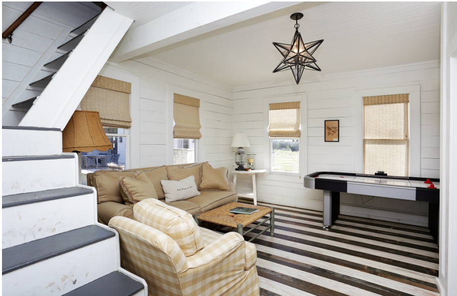
Guest House - mix of new & old flooring