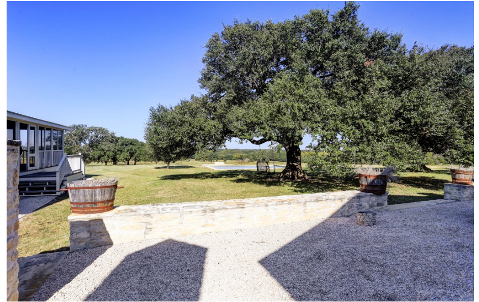
Guest House from Back Cooking Area