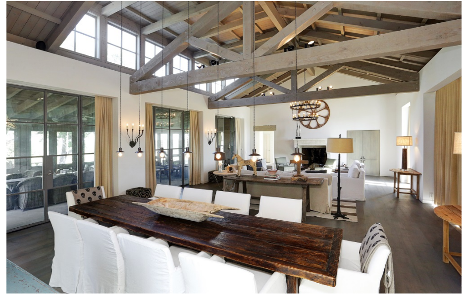
Living / Dining Room