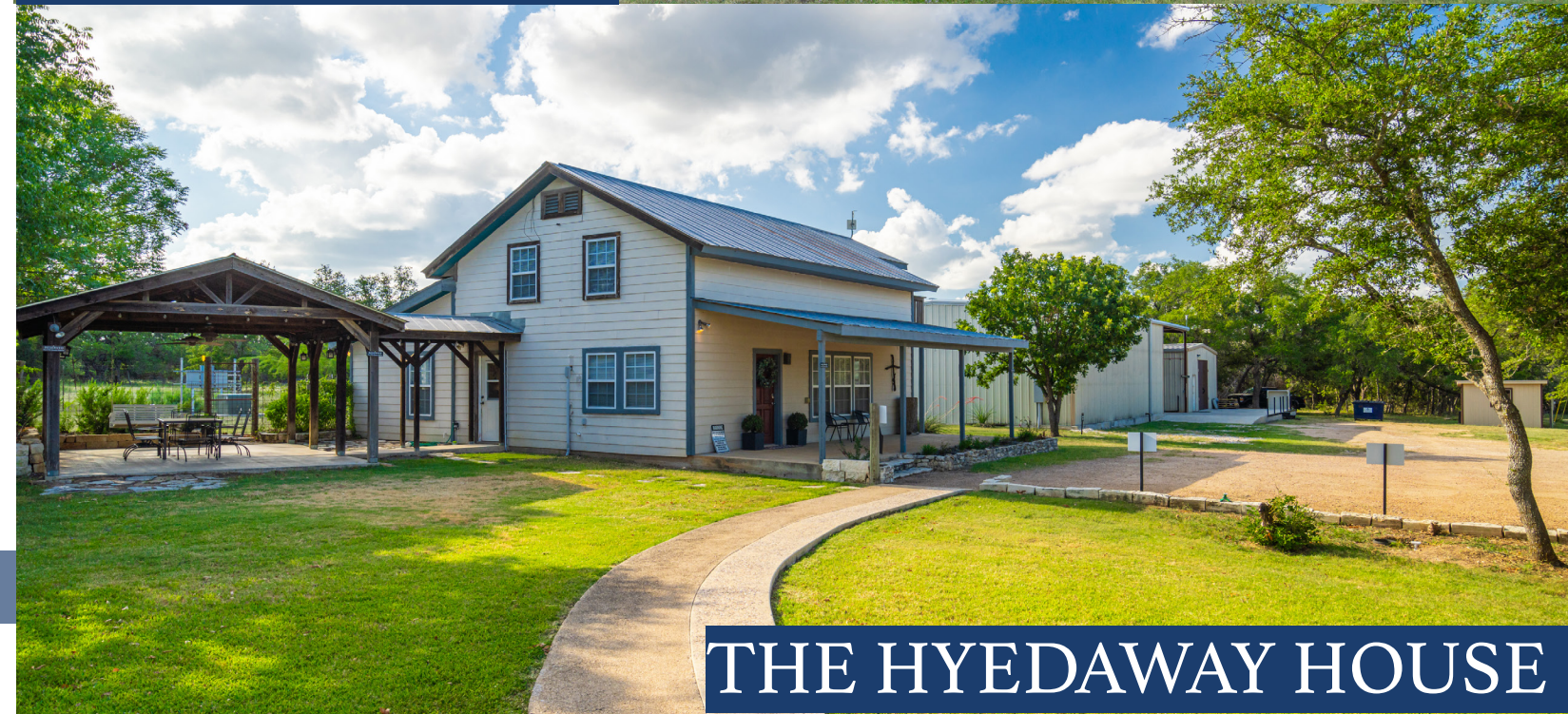
THE HYEDAWAY HOUSE