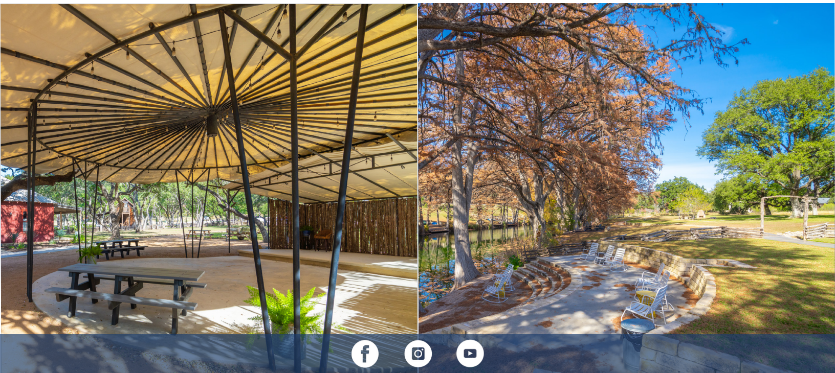
Frio Cañon Community Amenity

Leakey offers a variety of services including: numerous restaurants, a small grocery store, a feed store, hardware store, auto supply, convenience/fuel and a couple of liquor stores. Leakey hosts the annual July Jubilee around 4th of July weekend including a rodeo, a well-attended parade, a fair and a street dance. Garner State Park and Lost Maples State Parks are also nearby.